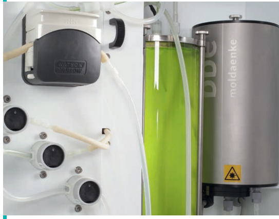
Sample water is mixed with the algae test olution and then analysed.