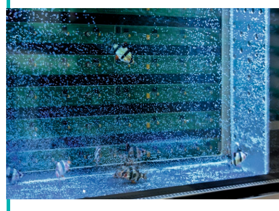
The ToxProtect II monitors the swimming activity of fish in an aquarium fed with drinking or mains