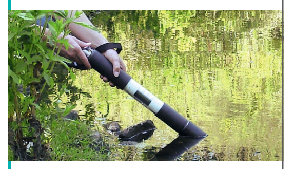
AlgaeTorch measurement on site.